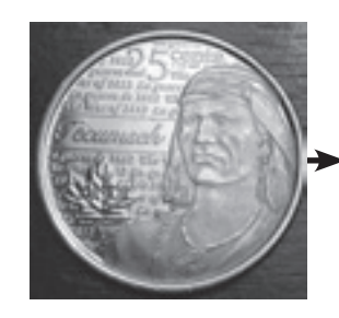
This Native American was born into the Shawnee tribe and devoted his life to defending his people's homeland and culture against white settlers. He became a national hero and was killed in 1812 during a battle in Canada.

Look at the Canadian coins above and fill in the missing words (typical Canadian symbols) from the box below.