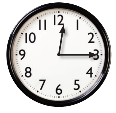
Time to Go Back to Class