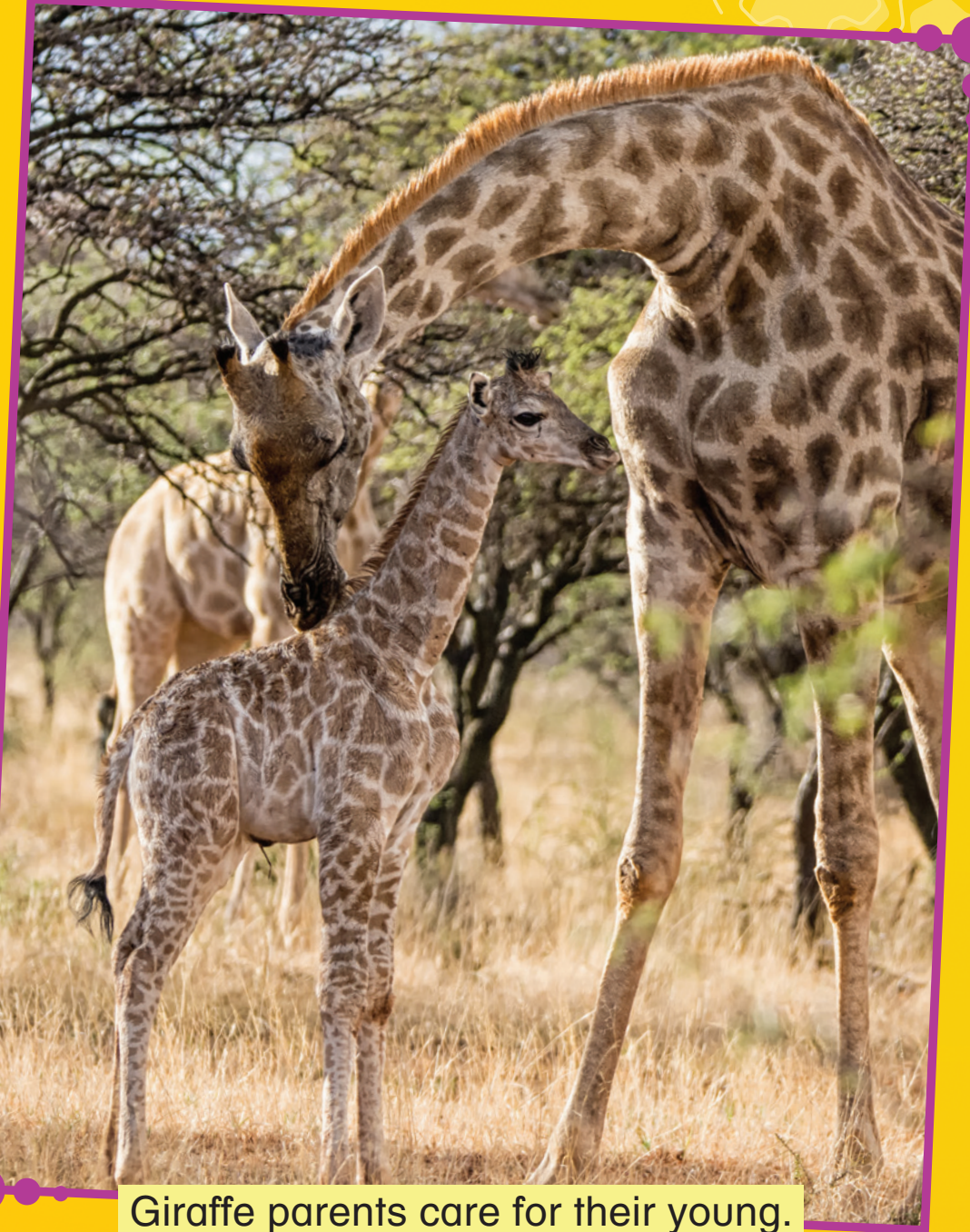
Giraffe parents care for their young.