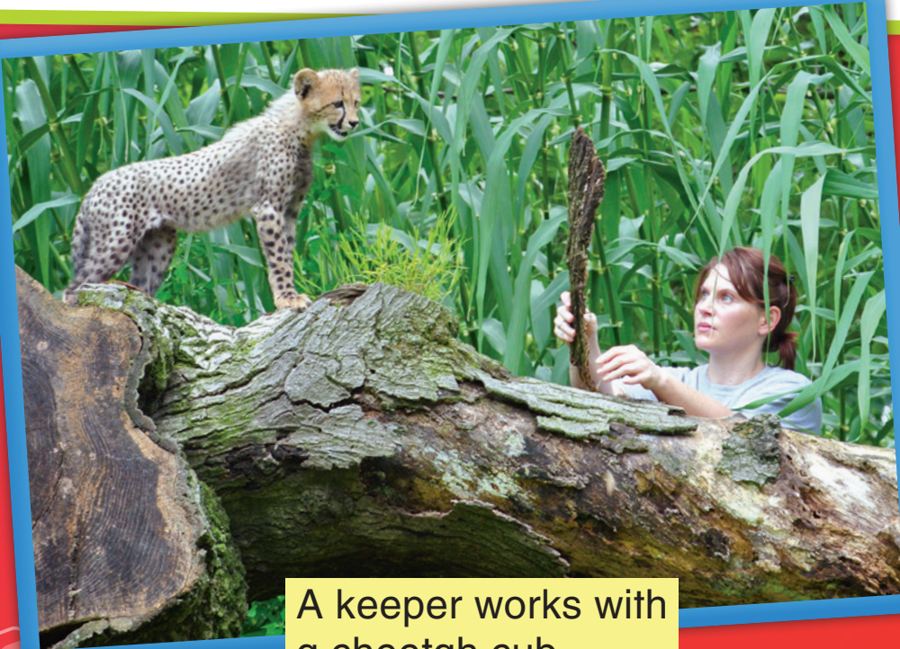
A keeper works with a cheetah cub.

Keepers help young animals learn. First, they put the babies in safe homes. They fill those places with sights and sounds that the babies would find in the wild.