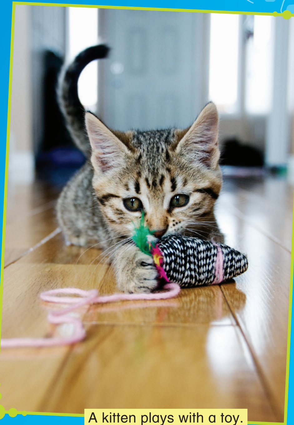
A kitten plays with a toy.