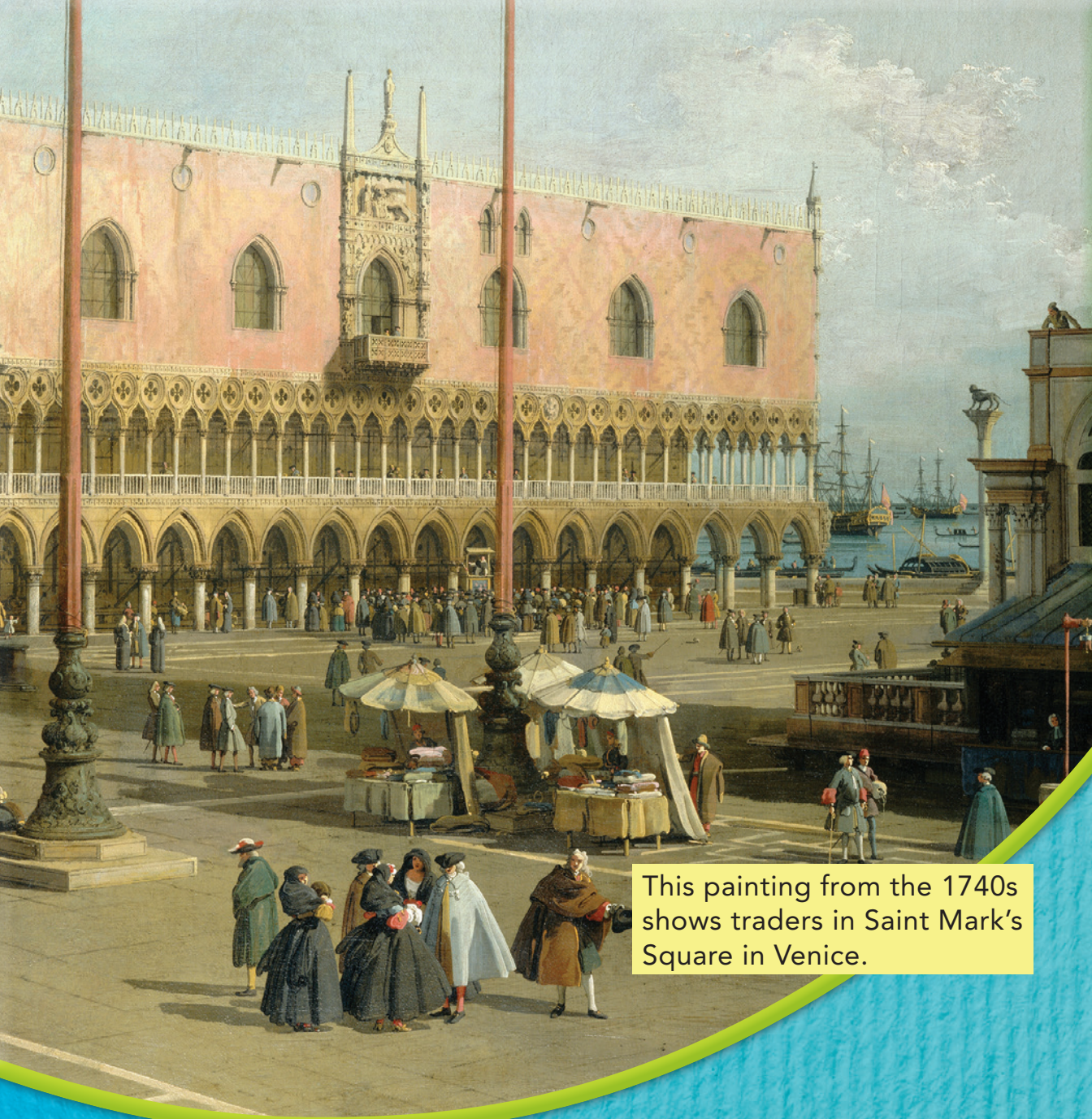
This painting from the 1740s shows traders in Saint Mark's Square in Venice.

Venice used to be its own country. People have lived in the area since around AD 568.