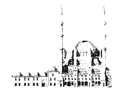
A Muslim place of worship called a mosque<sup>5</sup>.